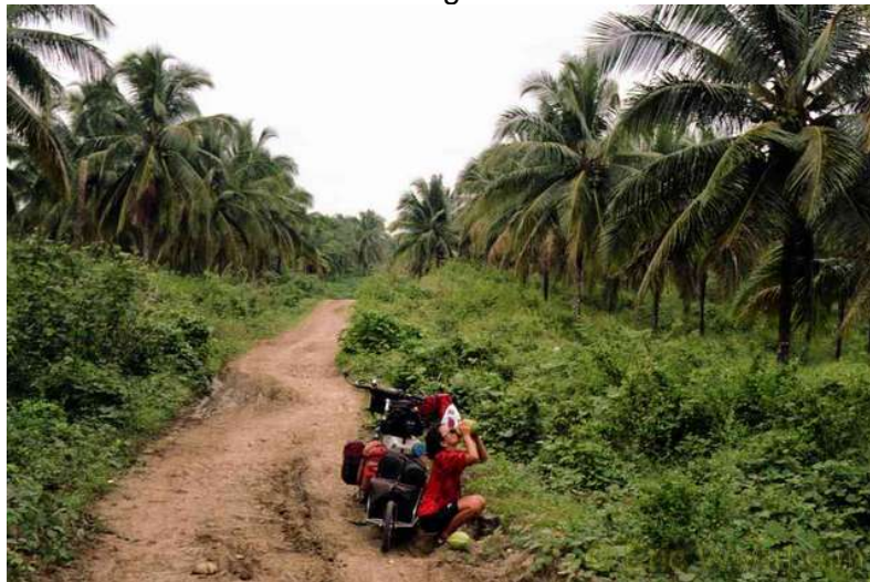
Coconut milk service station