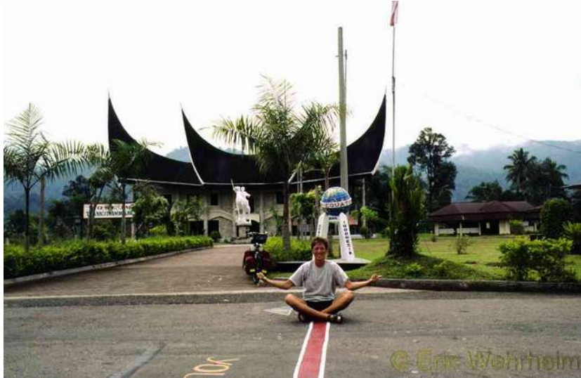
North and South