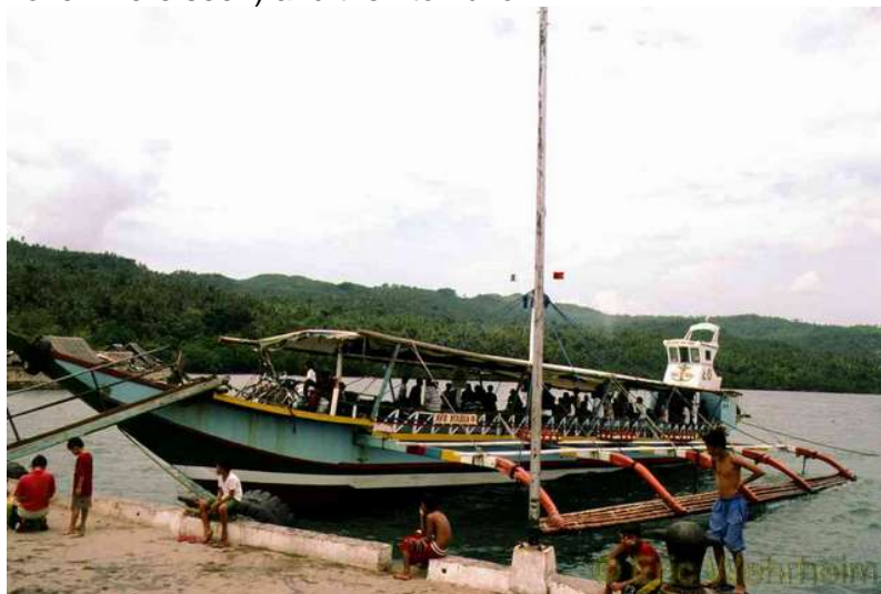
The Philippine Bamboo-Boats

A little knocked up and with wavering course we left the boat on Davao, Philippines. First we've got all our stuff together, packed the bicycles and then we looked for a restaurant. There wasn't a big selection of restaurants but a small pizzeria invites us to come in. At the time waiting for our pizza I felt some moving, so I thought this is a feeling afterwards from our shipping trip but the woman who was working at the cash box said by the way: "Oh maybe this was an earthquake". In fact it was a very small earthquake and so a nice warmly welcome to us on the Philippines. Afterwards we heard that at this day the volcano Mayon was getting active again, after a long inactive time. Later after some weeks we also passed this volcano very nearby but first we'd took a ride in the southern part of the Philippines islands. So after crossing Davao from the south to the north we shipped to the islands Bohol, Cebu, Christmas islands, Samar, Mindoro (where we passed the Mayon volcano, but only a few clouds of smoke where seen) and then to Luzon.