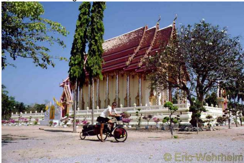
A Thai Tempel