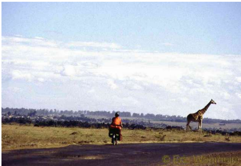
Giraffes on the roadside

After this amazing roundtrip we've gone to Mombassa to find a boat to India. But we've got no luck. We visited some different shipping agencies and they got a lot of shipping routes to India. But on no one it was possible to catch a ride. The fact was, so they telling us, that they have to get an insurance for every passenger that they transport on their ships. And the ship owners who sit far far away from Mombassa, mostly in Europe, USA or Japan, never get in touch with the idea, to spend a minute of their busy time to get these insurances. So it was waste less time and we have to think about an alternative to cross to India. Well, the only real alternative was to fly, so we bought to tickets for a flight from Nairobi to Mumbai. The days that we have to wait for our departure we spend on the coastline of Kenya, a little bit up on the north from Mombassa. Then, to reach our flight, we took a train to get to Nairobi.