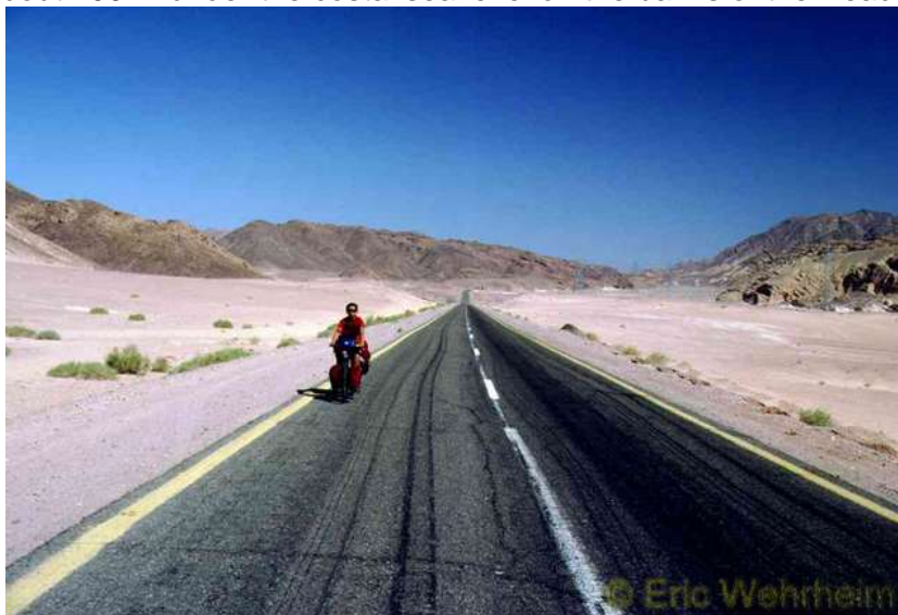
On the way to the Dead See

After Tel Aviv we followed the road inland to Jerusalem a so crazy and overloaded place with historic facts and figures. The old town, where we staid was very interesting. You could feel this vibration of religiousness and fanaticism on every corner. Happily at these days Jerusalem and the rest of the land was very quiet. Only a few months later it changed again dramatically. We followed the eastwards and it was going downward the hole day and at the end we was about 400 m under the costal sea level on the banks of the Dead See.