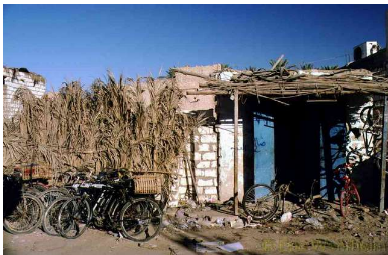
A modern bicycle-shop in Egypt