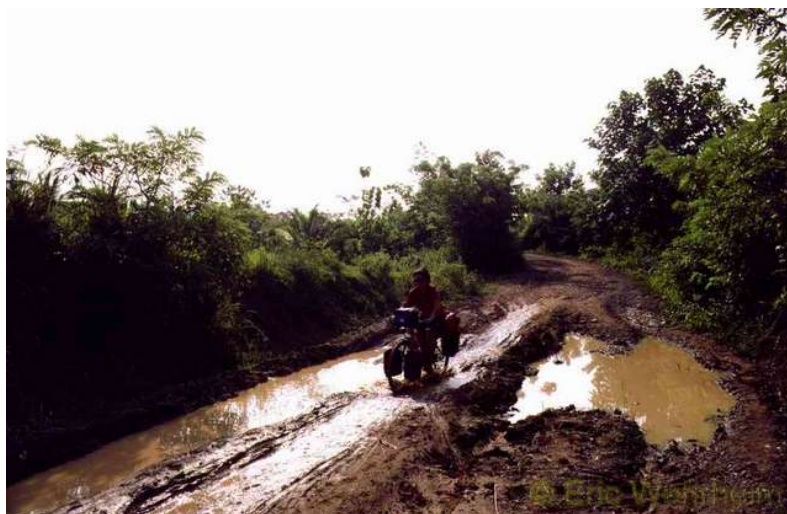
Hardcore cycling on Java