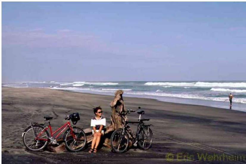
Nearly alone on a wide black sanded beach

Later on Java we visited Yogyakarta, a very important cultural site and then we made a trip up to the volcano Mt. Bromo. Then we took a small ferryboat to the island Bali. We crossed this island in the north; far away the hyper-touristy places in the south.