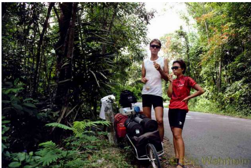
Lunch time with the main dish, salted crackers

But on Sumatra, the biggest of these islands we spend around two months. We visited e.g. an Orang-Outang rehabilitation station and Tuk-Tuk, an island in an island because it is situated in a big volcano crater sees. Then we had to leave the country for renovate our visas. Very adventurously we shipped with a cargo and passenger ship a long river downstream and thereafter we crossed the open sea. On a small island nearby Singapore we got from board. There we left our bicycles in the hotel where we staid for the night and shipped again now to the modern world of Singapore. This small city country for mostly of the travellers a shopping paradise was for us only hustle and bustle. The distance to Indonesia was to big, in culture and also in the way of living. So two days was more than enough for us and we went bag to our small Indonesian island and from there with a big ferry boat down two Jakarta on the island Java.