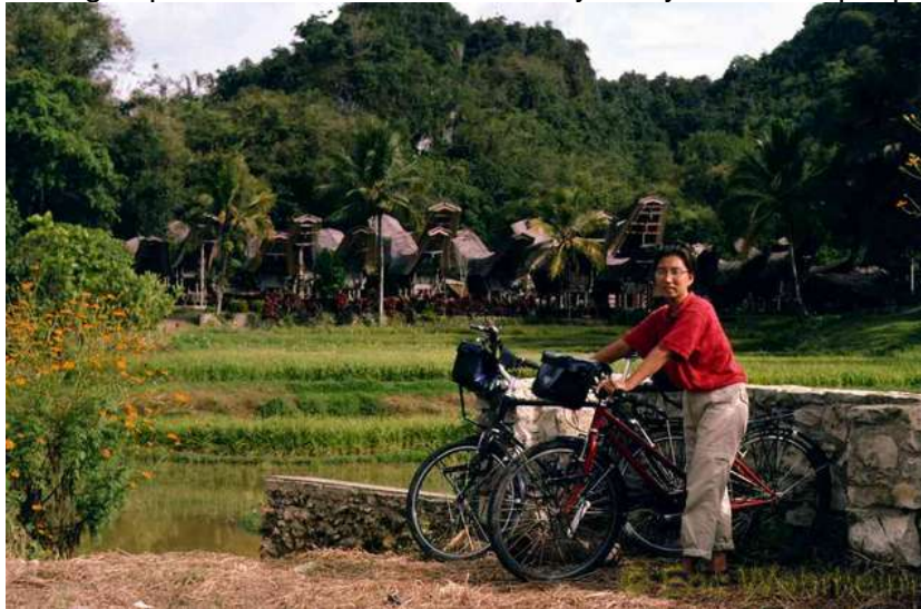
The houses of the Toraja

Then again some crossovers in a ferryboat to smaller islands. From Sumbawa there was a bigger passage in a big ferryboat to Sulawesi. We bought a first class ticket to be sure to have some comfort on the boat but also for safety reasons, because in the second class you have to share the room or worst on third class, the whole deck there is sharing the space. Well this can be funny and a good place to get in contact with the locals but later at night, when you fall asleep also a good place to lose your stuff. After 20 hours on this boat we arrived on Sulawesi. The first few days we spent in the city and we saddled the bikes to heading up to the north. Now straight up to Korea. But first we visited the place Suaya, which is a very special place. In fact nearly all people in Indonesia are Muslims but here in a small area a small ethnic group of Christians survived. Toraja they called the people there.