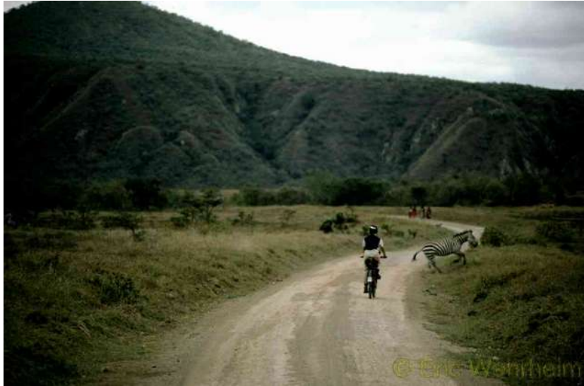
Inside a park