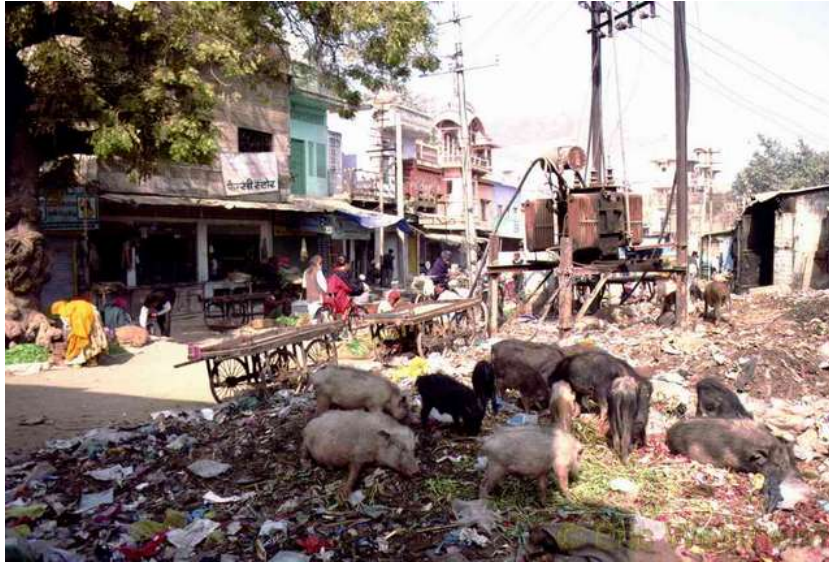
Public garbage place

So again there was a flight that we had to catch but this time everything proceeded without any complication. What a surprise.