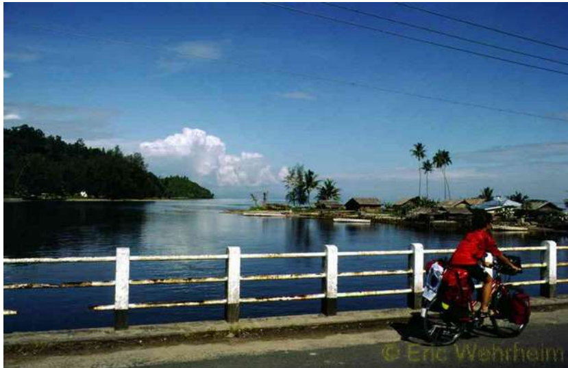
On the coast side of Sumatra

The boat was looking like a banana and the ride was very rough. Well shaken we left the boat in the harbour of Medan. Now more than 13000 islands were waiting for us, because Indonesia has this number of islands. Well, not all of them we want to visit and not all of them are inhabited.