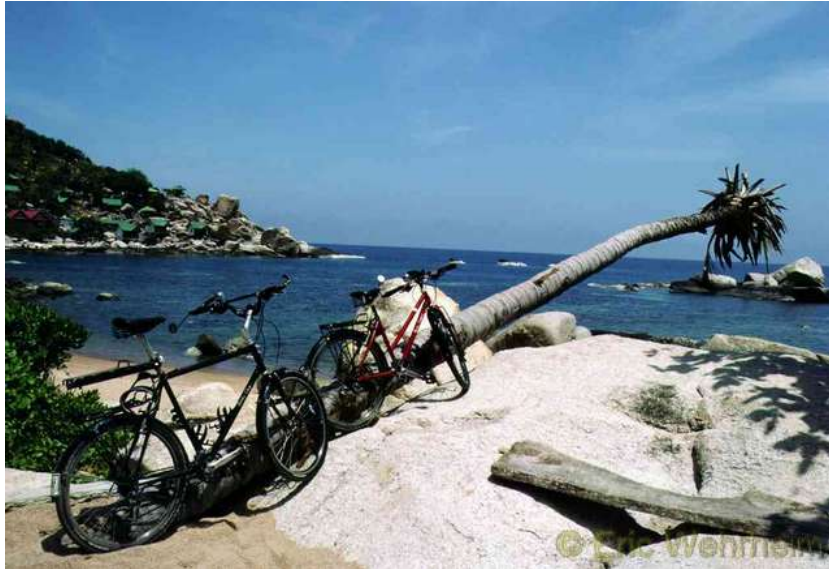
On Koh Tau

To fast the time flows away in Thailand, a country so pleasant and fascinating. Malaysia, our next destination we touched very short only on the island Penang. From there we shipped to Medan on Sumatra, Indonesia.