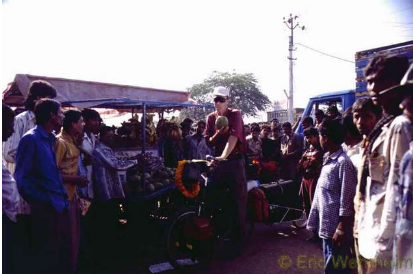
Everytime an attraction

But no one of them got the courage to speak to us. There was a lot of whispering every time in these groups and the only word that we could understand was gear bike. O.K. that's easy to understand because in India where many people ride a bicycle there is no cycle with gears. So this was the most common interest in the group. Also every time there was one person who thought that he must explain to the rest how a gear system of a bicycle works.