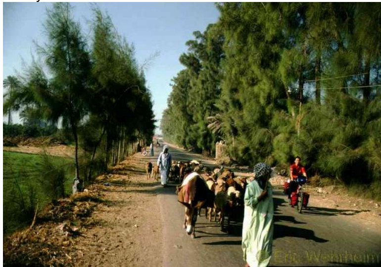
On the way in Egypt

We followed the Red Sea and passed the Sinai, outside the thermometer stands up over the 50°C. degrees. There we saw the first time some children from whom we were warned before by reports from other travellers. Maybe for them some tourist on a bicycle is such a strange thing, or only for them it looks maniac so for this reason they throw stones to tourist bicycle drivers. We were prepared and we got an arsenal of some stones on our handlebar bag so we could demonstrate that it was necessary we could throw back some stones. Never before we were thinking to hit a child or to throw a stone to them, but as we read in the guidebook this kids could be a serious and dangerous problem. And it worked well because as we saw them on the street and only shown them that we are also got 'weapons' they decided not to throw a stone to us. After this experience we landed in the big and chaotic city of 1000 and 1 night, Cairo. Well, here none throw stones to us but we thought that every one would like to make a business with us. Mostly they want to sell something but other ones came with a heart-rending story that his child or his wife had to be operated soon, they had no money for this or some different story even worse. It was a nightmare to walk around in the center of the city.