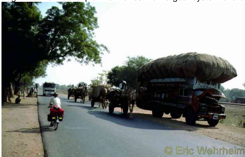
A normal road situation

But no one of them got the courage to speak to us. There was a lot of whispering every time in these groups and the only word that we could understand was gear bike. O.K. that's easy to understand because in India where many people ride a bicycle there is no cycle with gears. So this was the most common interest in the group. Also every time there was one person who thought that he must explain to the rest how a gear system of a bicycle works.