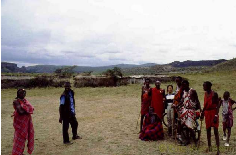
With the Maasai

The jump from Egypt to Kenya was enormous. No sand and dessert anymore and flat land, everything was green and hilly. Now the people wasn't light-skinned they was black.